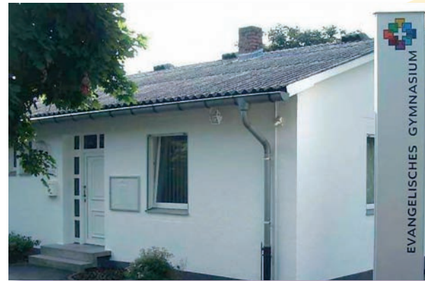
The Protestant High School Bad Marienberg

BAD MARIENBERG. Beginning with the school year 2005/06 the Protestant high school opened its doors to 56 students, offering a sophisticated morning and afternoon curriculum. Everything is still new and has to be tried out first in an experimental way.