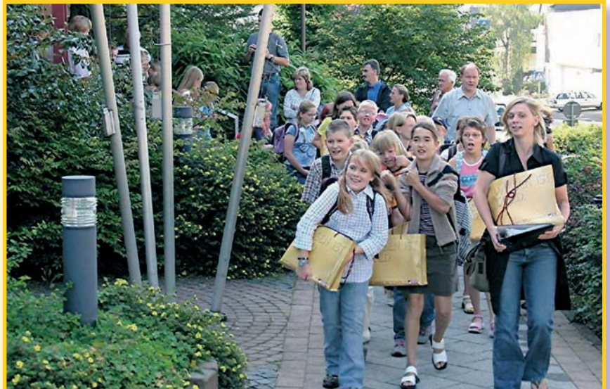
Good feeling: The first day in the protestant school in Bad Marienberg in September 2005.

every tract, allowing students to withdraw and take a break. We will do away with the rigid 45 minute rhythm of classes. That will reduce the arbitrary interruption, disturbing the natural flow of learning,” the principal Hartwig Scheidt says. Team work has top priority. That’s not easy, because here too work has to be graded and regardless of proclaimed liberality and flexibility, teachers have to stick to a prescribed curriculum.